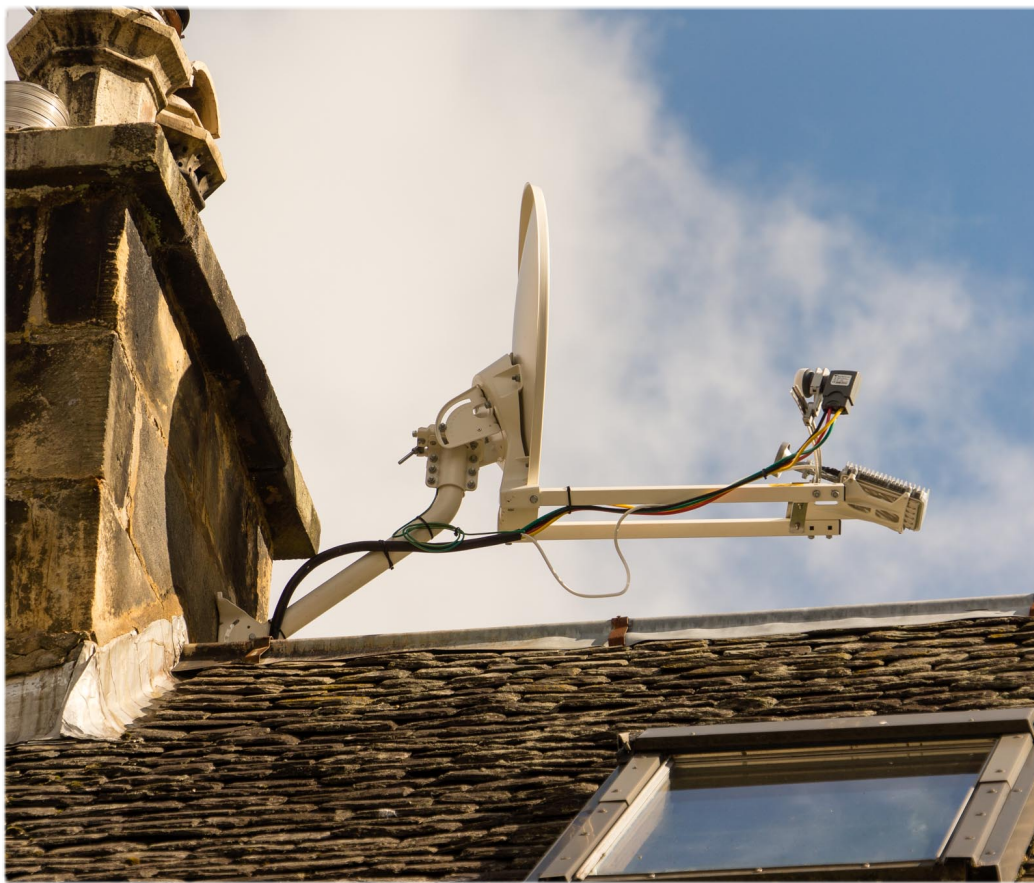
Figure 3 – Tooway Satellite installation with additional Sky LNB

dish on a historic building. The offset of the Sky LNB (which slightly degrades reception) is compensated for by the slightly larger size of the Tooway dish (72*68cm versus the 75*55cm dimensions of most Sky dishes), so Sky HD works very well under this arrangement.